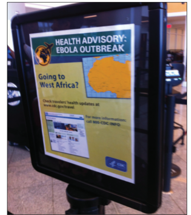
Health advisory for airline travelers